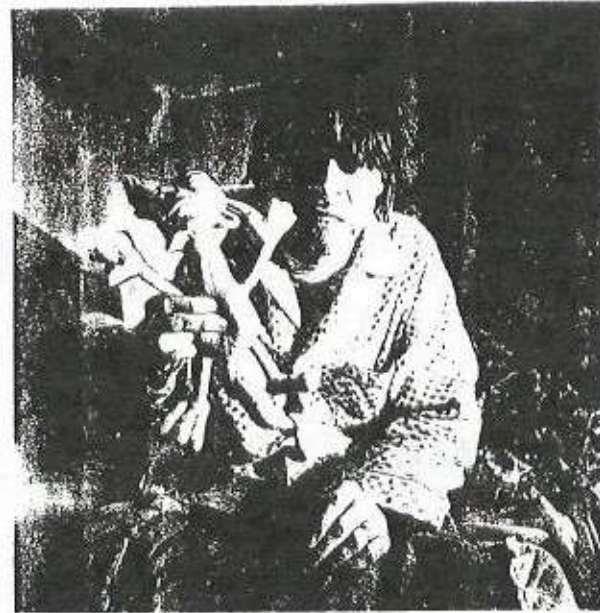
exhibit D: We're not hitch hiking anymore, we're riding.

Later on in the song, Kurt takes on the role of the "scentless apprentice" but now it seems he has grown, he is no longer the butterless babe. Now it appears he will partake in dairy consumption which, in the case of most lactose intolerants, results in flatulence. Because the body is unable to digest lactose, it transforms it into a gas that leaves the body in "fumes" but because the scentless apprentice has had no smell for so long, these farts, if you will, produced by dairy consumption, smell like perfume to him. He is no longer the (dairy free) scentless apprentice. He is now a dairy consumer, an autonomous being, and, of course, he is no longer senseless or scentless. He is a master of his senses.