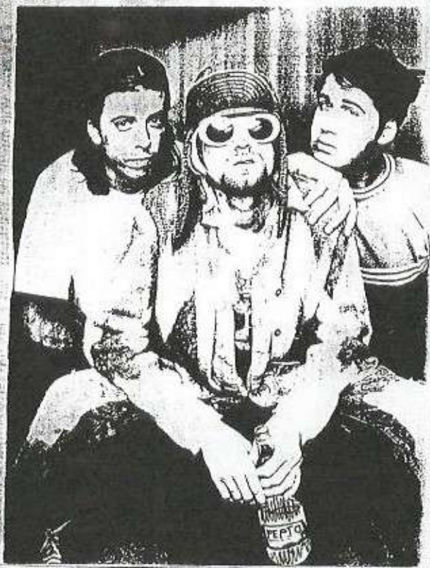
exhibit C: soothes while it relieves